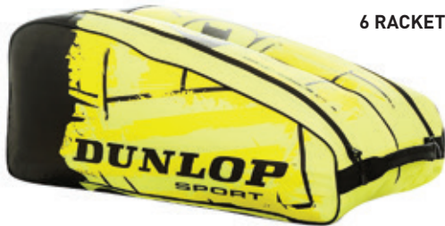
6 RACKET THERMO