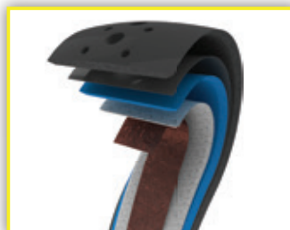
Copper Tape Replacement Grip