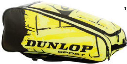
10 RACKET THERMO