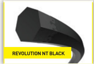
REVOLUTION NT BLACK