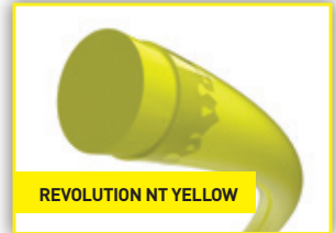
REVOLUTION NT YELLOW